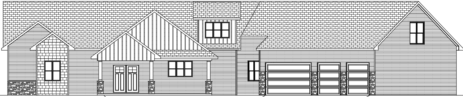
FRONT ELEVATION 2483 sq.ft. main floor 788 sq.ft. upper floor 590 sq.ft. fut. bonus rm.